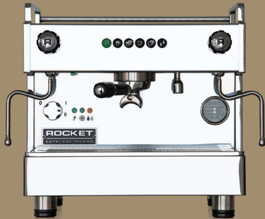
1 Group BOXER