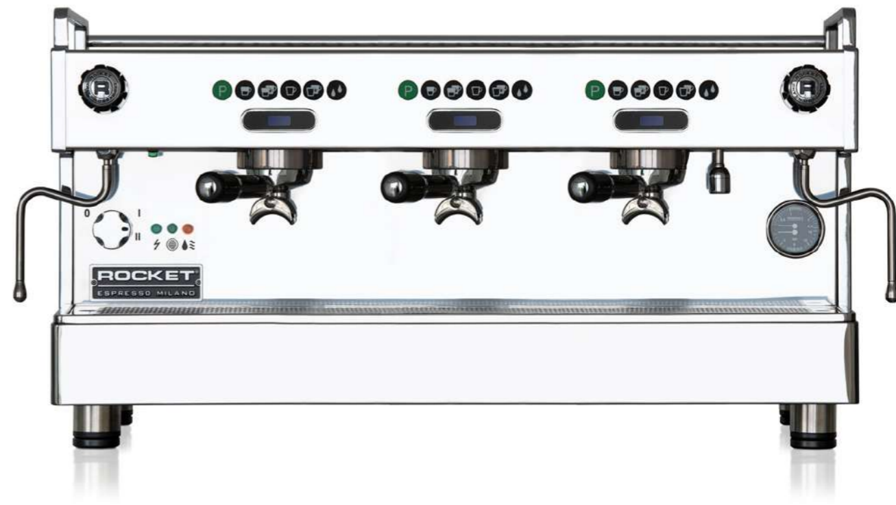
3 Group BOXER with optional shot timer