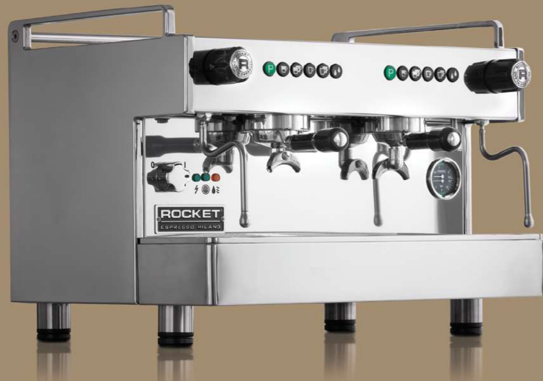
2 Group BOXER